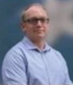
Heath Wall Van Buren County